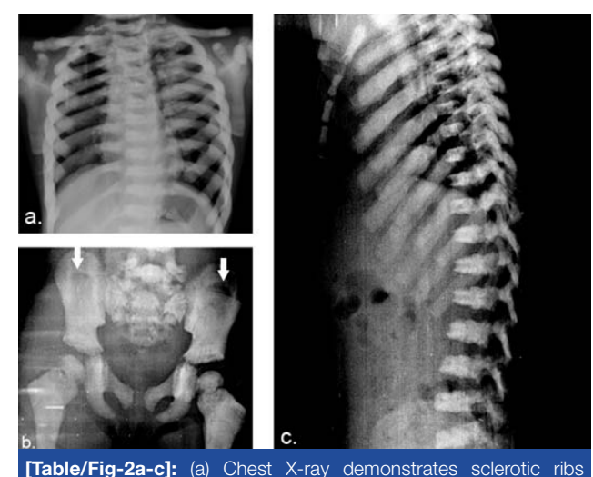
(hable) rig-2a-cj: (a) Chest X-ray demonstrates sciencic has and clavicles with homogeneously increased density and no trabeculations or cortico-medullary differentiation (b) X-ray pelvis with both hips reveals a curved line paralleling each iliac crest (arrows) giving a bone within a bone appearance (c) X-ray DL (dorso-lumbar) spine lateral view shows dense sclerotic bands adjacent to the vertebral endplates with normal mid body, giving the appearance of the "sandwich vertebrae"

dense but are actually brittle and are susceptible to frequent pathological fractures [1].