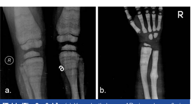
[Table/Fig-3a & b] : (a) X-ray both knees AP view shows flaring and elongation of the distal femoral and proximal tibial metaphyses (Erlenmeyer flask type deformity), with uniformly increased density of the bone along with obliteration of medullary cavity. Multiple alternating dense and radiolucent transverse lines in the metaphyses can also be noted (b) Similar radiographic features can be noted in X-ray right wrist with forearm, which additionally shows old healed fracture of mid shaft of right ulna

Osteopetrosis is a rare bone disorder characterized by defective osteoclastic resorption of primary spongiosa of the bone result in dense sclerotic bone. Persistence of this primitive tissue, interferes with the formation of mature adult bone with a normal medullary canal, which results in abnormally dense but brittle bones. A balance between osteoblastic bone formation and osteoclastic bone resorption is essential for the normal bone growth which is altered in osteopetrosis. The pathogenesis of osteopetrosis is mediated by abnormal osteoclast function. It can be caused due to interference with the acidification of the osteoclast resorption pit, which may occur due to deficiency of the carbonic anhydrase enzyme