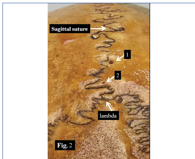
[Table/Fig-2]: Shows two parietal foramina (1,2) of unequal size located one behind the other on the right side.