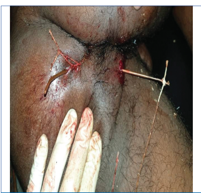
[Table/Fig-1]: Showing application of new ksharasutra over previously applied

For application of Ksharasutra, a metallic malleable probe with an eye was introduced through the external opening and was made to pass the tip of probe through the internal opening with every attempt not to create a false passage. The eye was used to thread with Ksharasutra and probe was gently drawn with the purpose