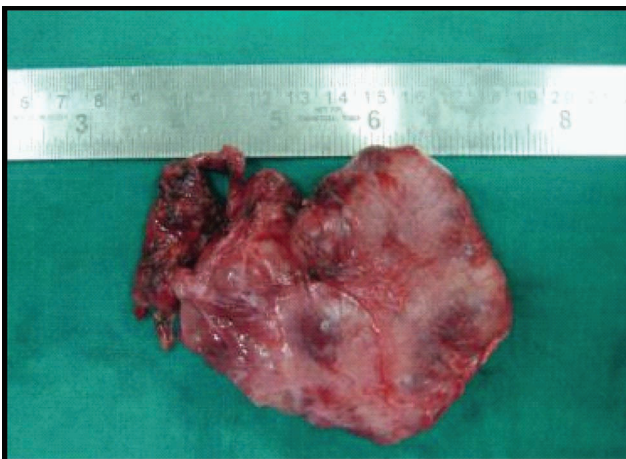
[Table/Fig-2]: Specimen of carotid body tumour.

The patient was under regular follow up and even after 8 years of surgery patient was in good condition. CT-scan and MRI shows no evidence of residual or recurrence.